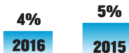
Percentage of women CEOs in the Fortune 500